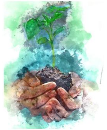
Ako tahi Tātou, Tipu tahi Tātou Together we Learn, Together we Grow

"Te tu pakari tahi, te whakamana i nga ākonga katoa." Standing strong together – enhancing the mana of all learners